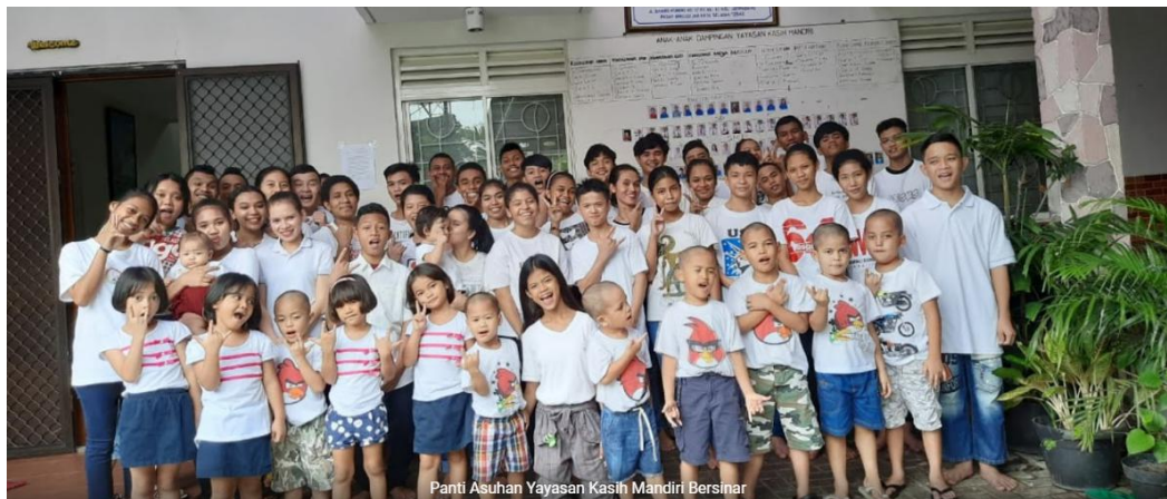
Pic 1. YKMB's lovely children taking photograph after a family event, 2020

YKMB or Yayasan Kasih Mandiri Bersinar was established on May 31, 1996 in Jakarta. YKMB is a social care foundation for poor and neglected children and youth. We serve and work in Indonesia regions like Jakarta, Depok, and also Ende-NTT. YKMB supports through formal education, non-formal education, and health care to help them create self-confidence, have continuous moral and self-development. Currently, we take care of almost 95 (ninety-five) persons in our homes, that consist of 13 children Balita (under 5 yo), 23 children in the elementary study, 21 children in their junior high school, 12 children in their senior high school, staff, Bruder and Sister in BSMC. In the middle of 2021, we are blessed to expand our missionary activities to Sintang, Kalimantan Barat.